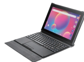
Keyboard with protective case (option)