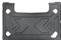
Protective case (option)