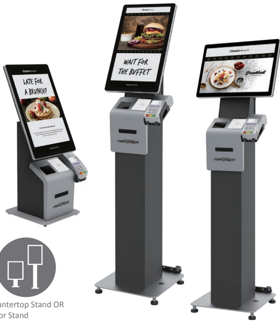
Countertop Stand OR Floor Stand