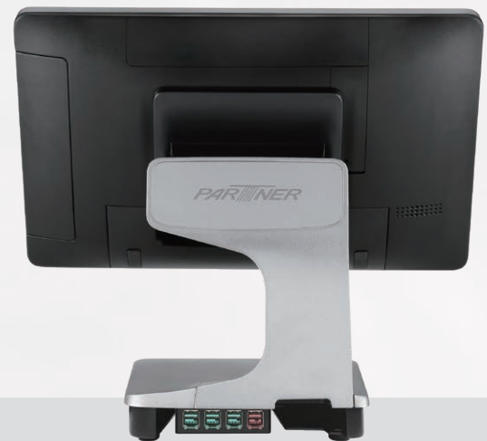
EX-100 and EX-101 can be integrated into the base of Audrey and Audrey II