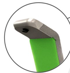
AI security camera